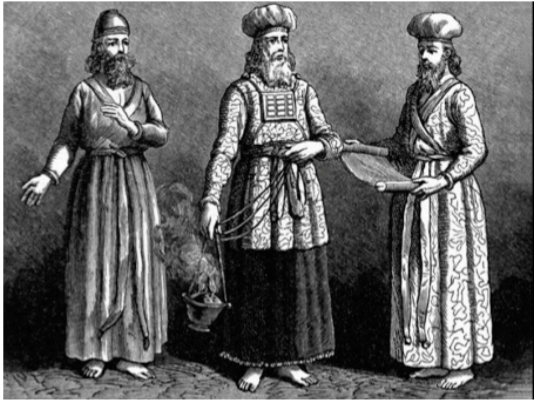
Illustration of Israelite Priests

"Have Aaron your brother brought to you from among the Israelites, with his sons Nadab and Abihu, Eleazar and Ithamar, so that they may serve me as priests.