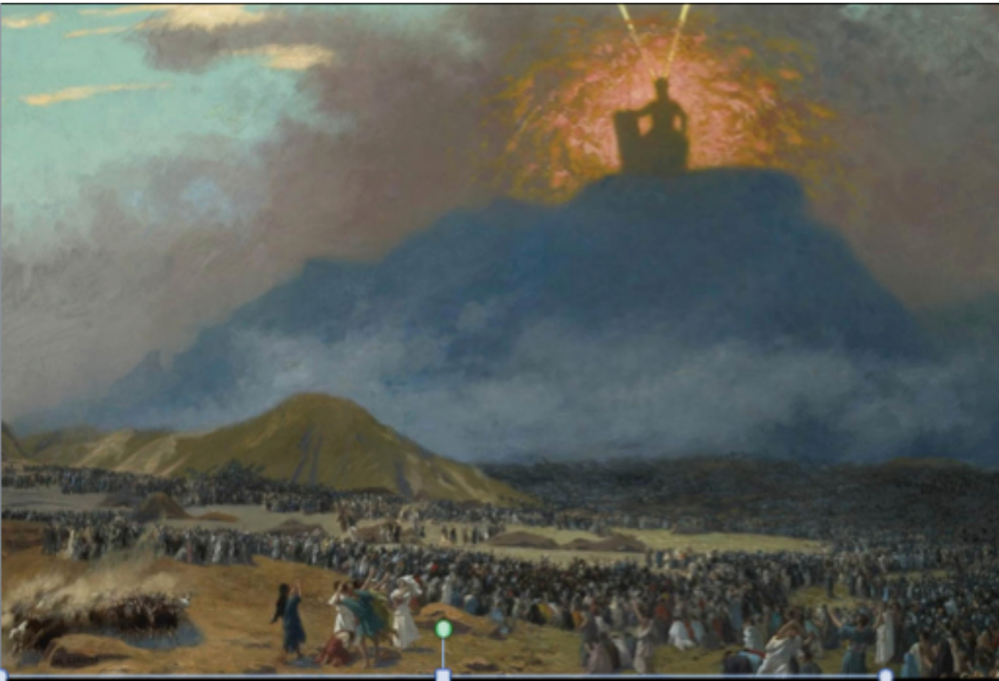
Moses on Mount Sinai , by Jean-Léon Gérôme, circa 1895 Public Domain

Next week... What the Israelites were up to while Moses was on the mountain with God