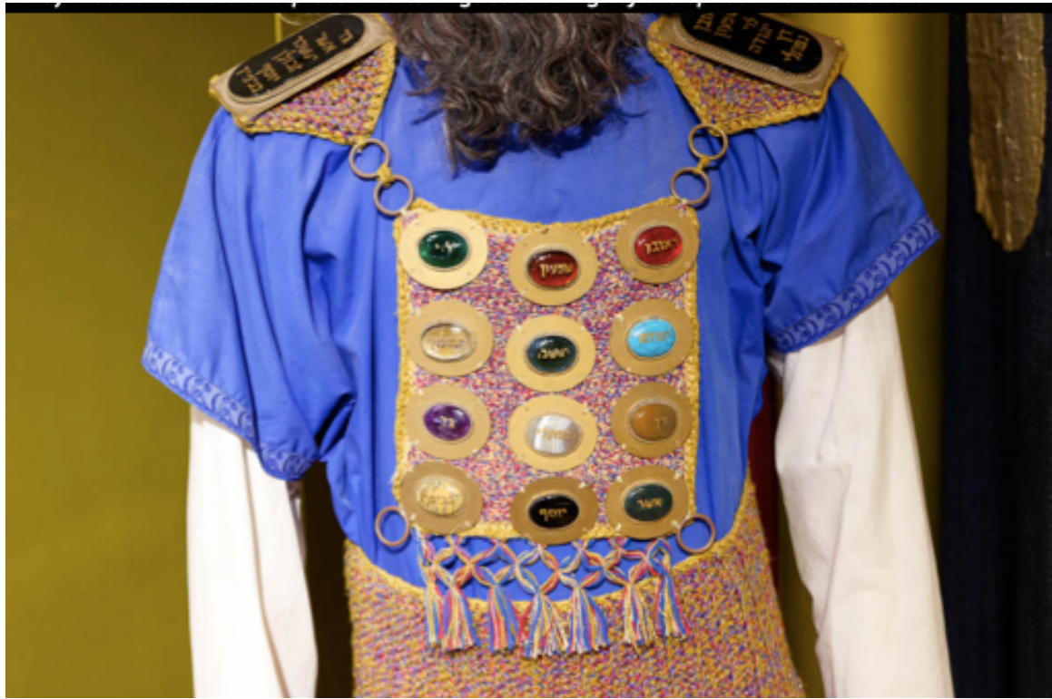
Breastpiece in a tabernacle model

"Whenever Aaron enters the Holy Place, he will bear the names of the sons of Israel over his heart on the breastpiece of decision as a continuing memorial before the LORD."