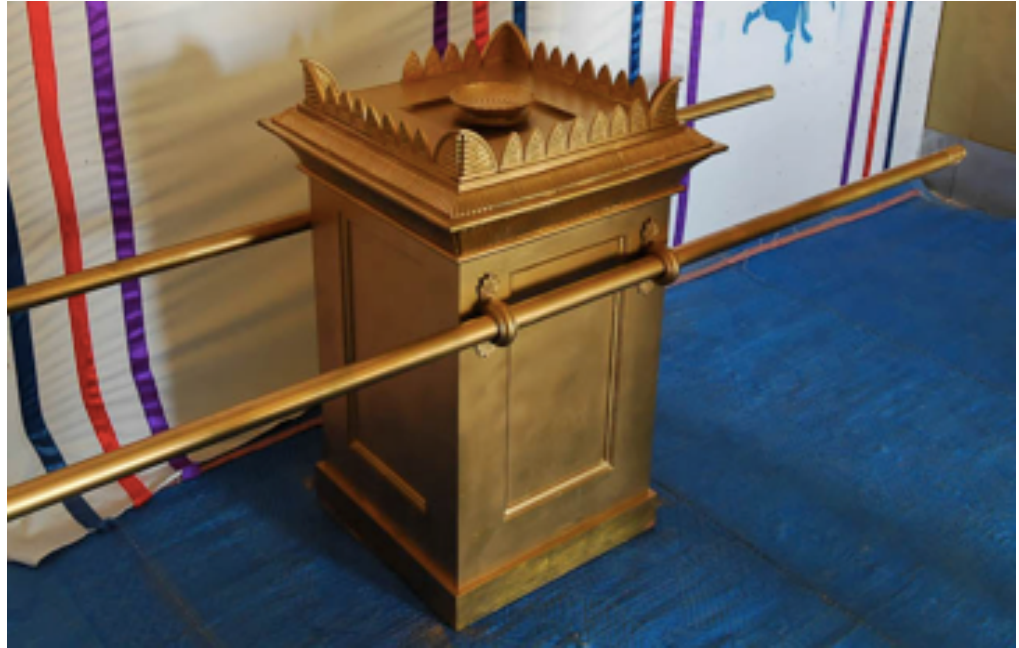
Incense Altar in a tabernacle model