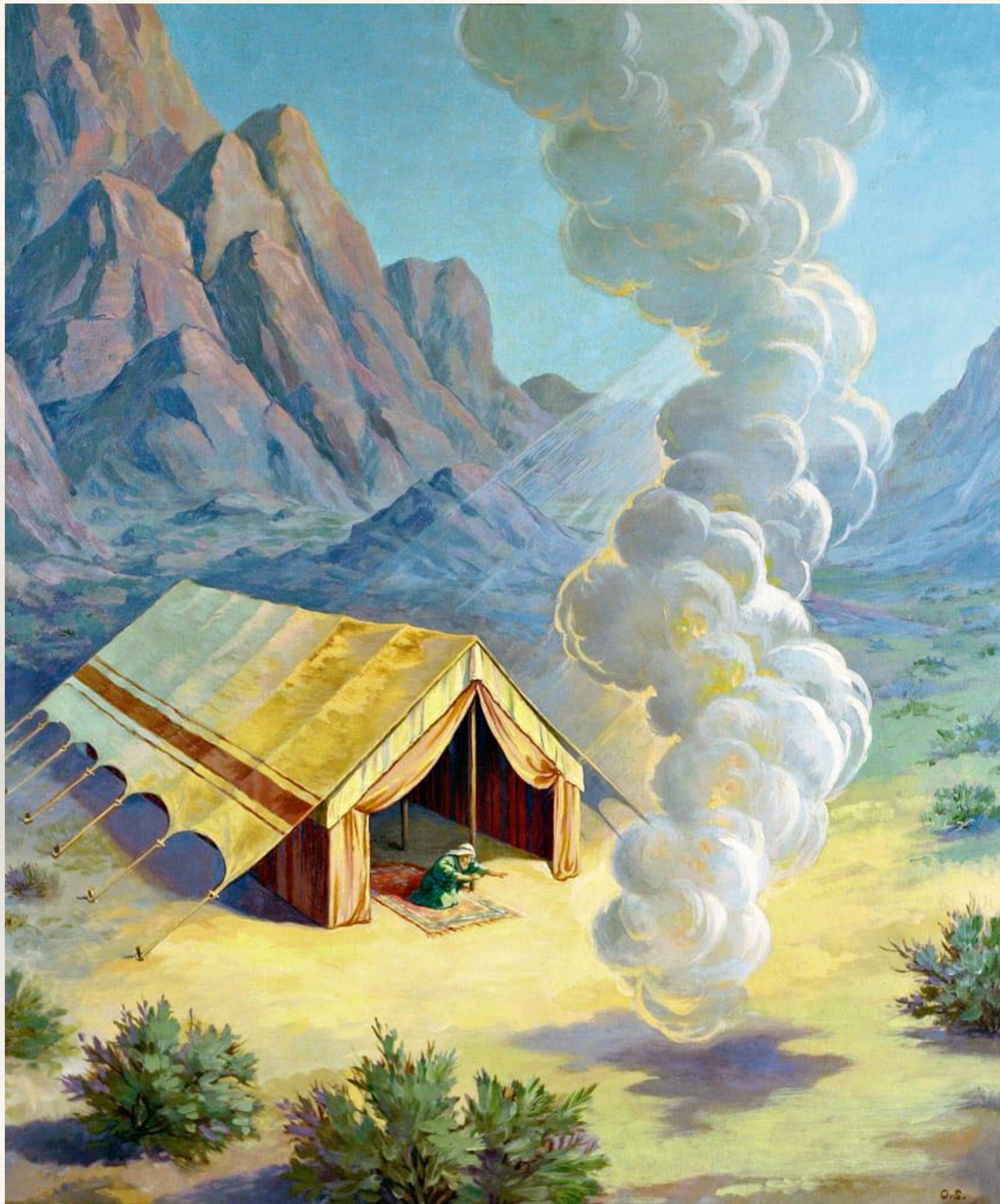
Tent of Meeting